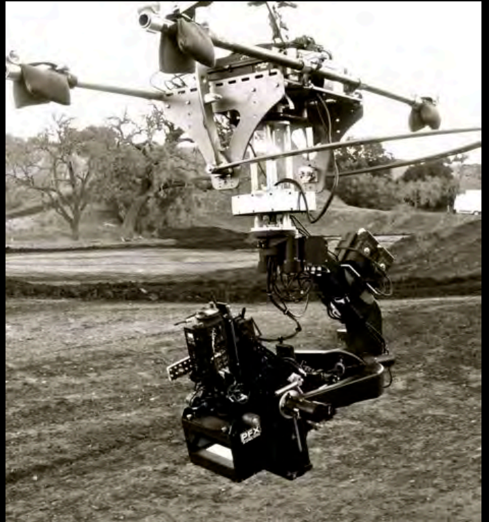
--3D Edge Head on Cable Cam--