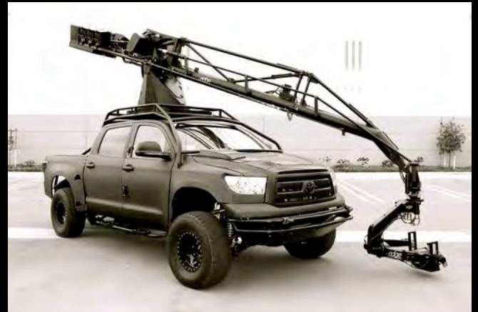
--Edge Off-Road Truck with Edge Crane and Edge Head--