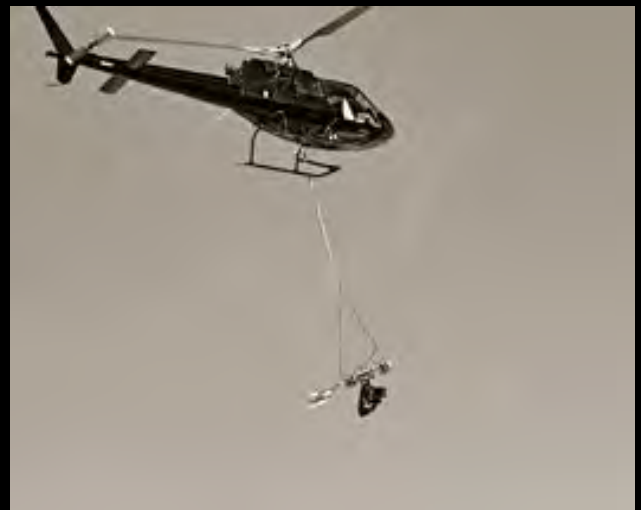
--Edge Head on Long Line Aerial System--