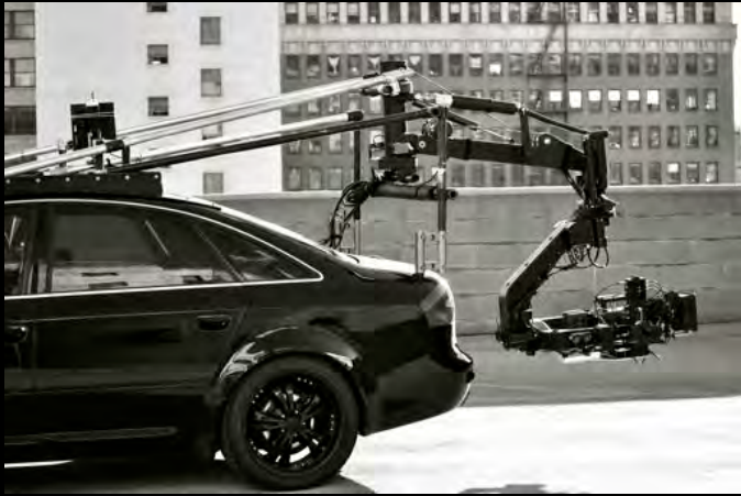
--High-Speed Audi A6 with Suspension Mount and Edge Head--