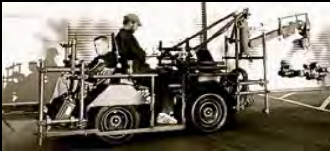
--Camera Quad with Edge Suspension Mount--