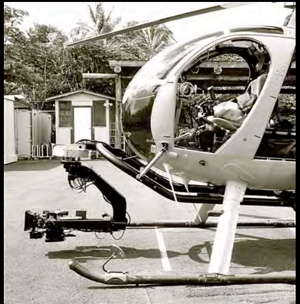
--Edge Head on Helicopter Mount--