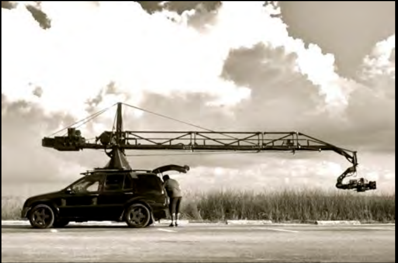
--Edge System with Long Extension--