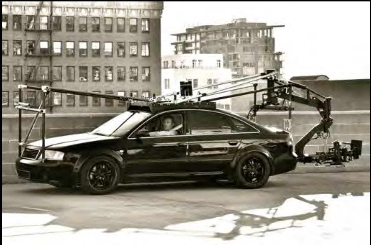
--High-Speed Audi A6 with Suspension Mount and Edge Head--