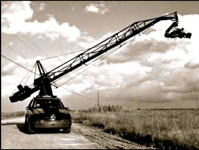
--Edge System with Long Extension--