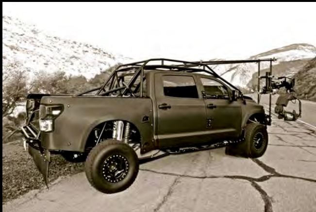
--Edge Off-Road Truck with Suspension Mount and Edge T190 Head--