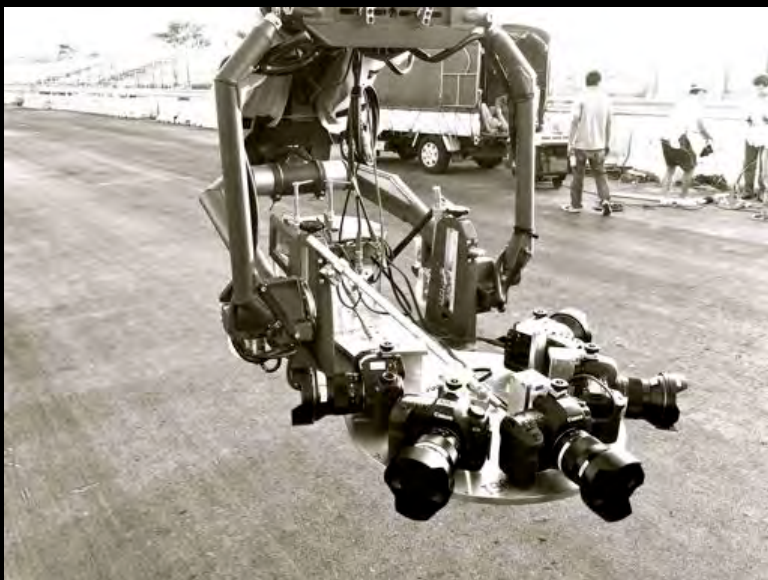
--Edge T190 Head with Canon 5D Camera Array --