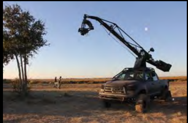
--Off-Road Edge System--

Performance Filmworks has an extensive fleet of purpose-built vehicles including the signature Supercharged Mercedes ML55, the Chevy Suburban, the Audi A6 Quattro, the Toyota Tundra Off-Road Truck and other specialized vehicles including watercraft, quads, and motorcycles. Additionally it has developed specialty rigging gear including suspension mounts, helicopter mounts and 3-D leveling heads to further complement and expand the capabilities of the Edge™ Systems. However unique the demands of your production may be, Performance Filmworks is a one-stop shop for all of your camera motion equipment needs.