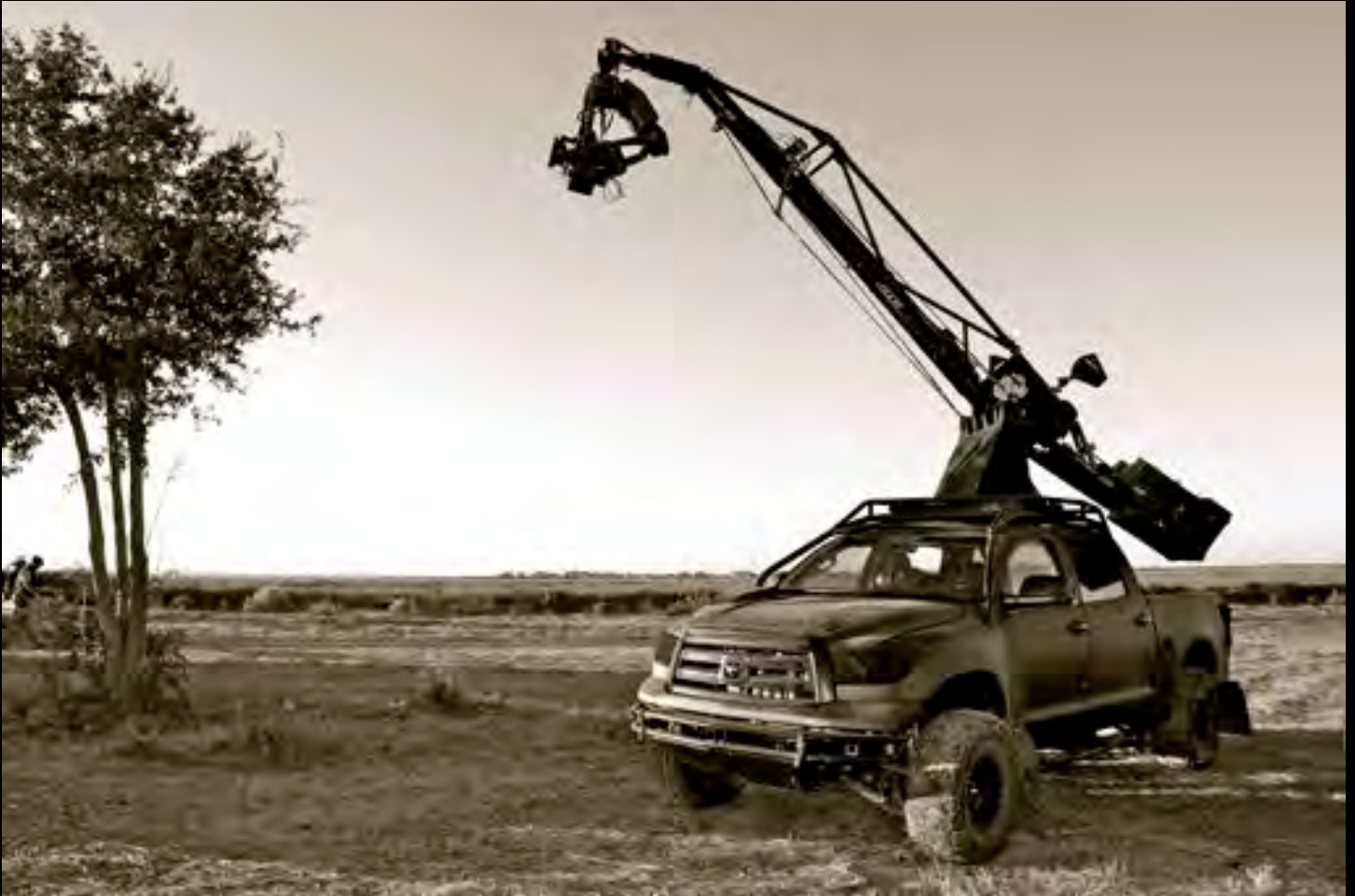
--Edge Off-Road Truck with Edge Crane and Edge Head--