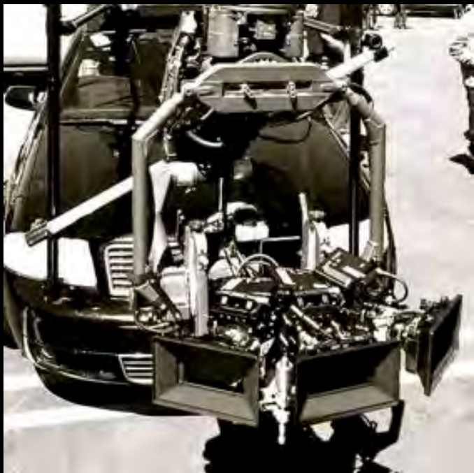
--Edge T190 with Array Plate and Three Red Epic Cameras --